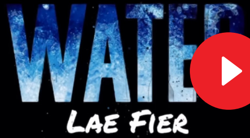
Lae Fier - WATER