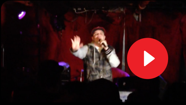
DropOut performing F.W.M at The Delancey in NYC (2014)