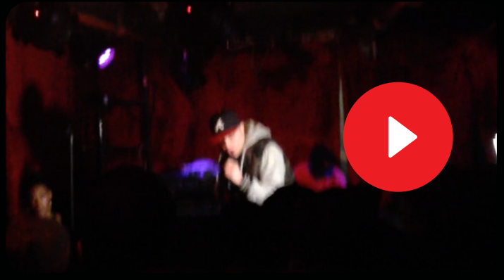
Dropout Performing Still The Same at The Delancey in NYC (2014)