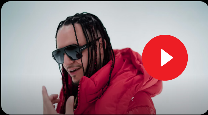
Lae Fier - Runaway (Official Music Video 4K)